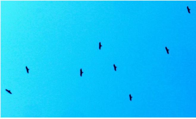
Figure 4. Black kite (Milvus migrans) flock

The lesser kestrel (Falco naumanni) and Common kestrel (Falco tinnunculus) (Figure 5) fly at comparatively lower height. Kestrels and Common buzzards (Buteo rufinus) use to perch on high trees and/or transmission line towers (Figure 6).