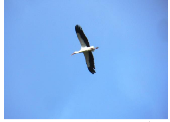
Figure 9. White stork (Ciconia ciconia)