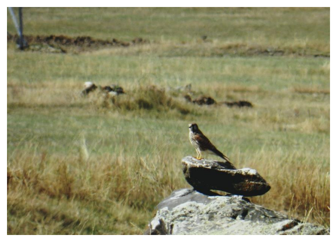
Figure 5. Common kestrel ( Falco tinnunculus ) registered in TL corridor