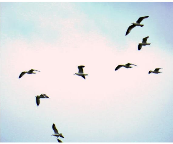
Figure 11. Eurasian hobby (Larus armenicus).