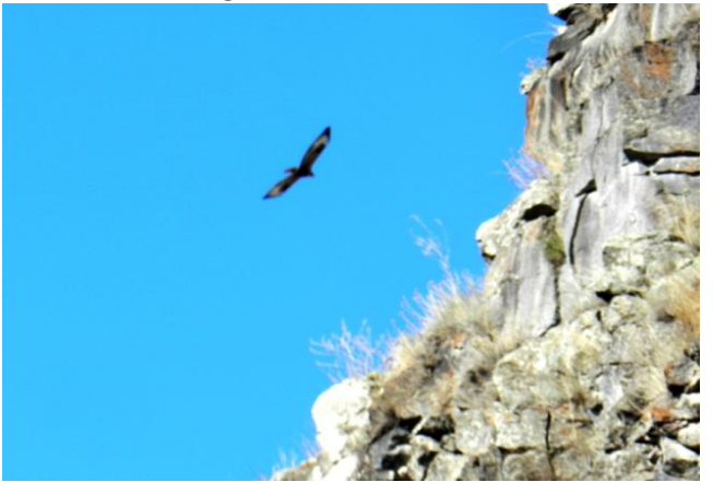
Figure 7. Long-legged buzzard (Buteo rufinus) above the Paravani gorge