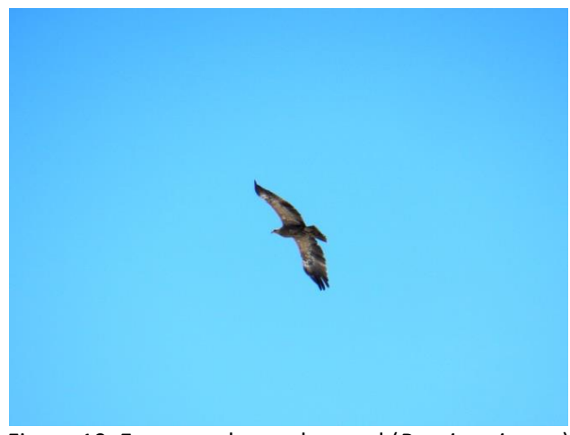
Figure 10. European honey buzzard (Pernis apivorus)