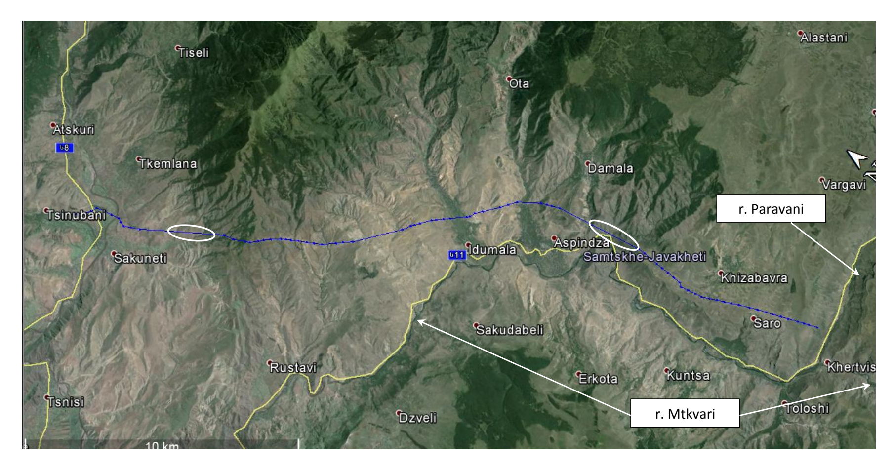
Key Sections not visited because of poor accessibility are marked with white ellipses